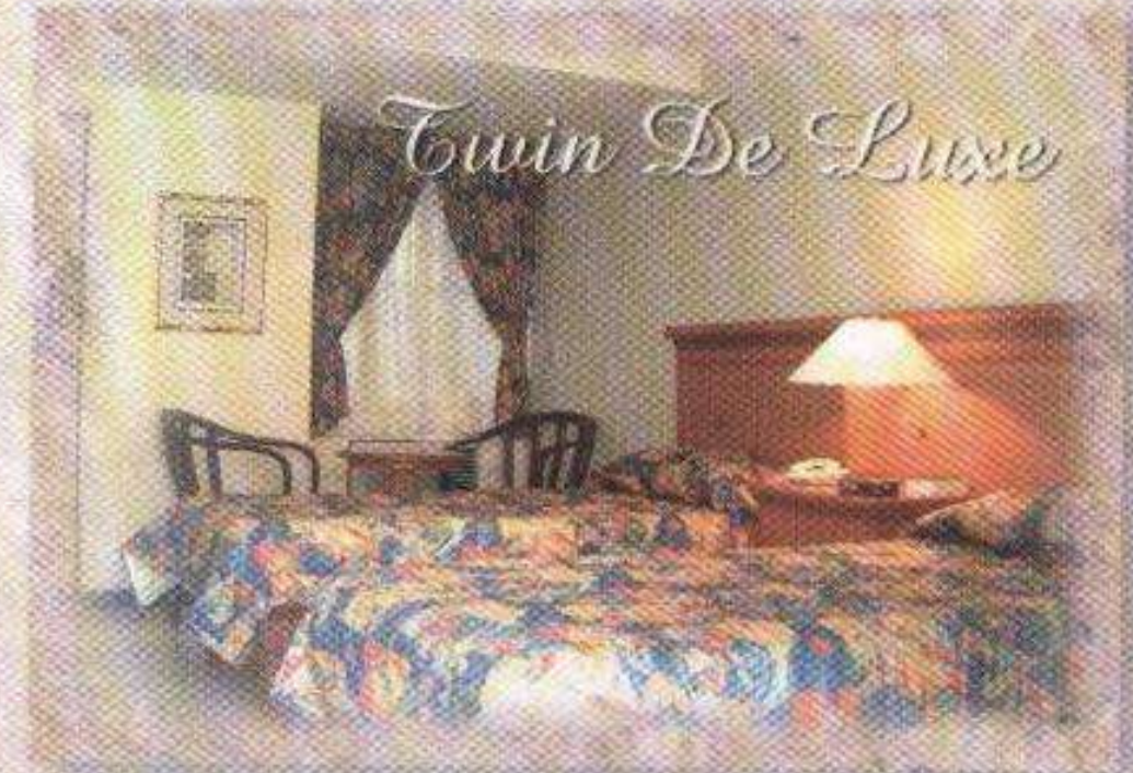
Twin De Luxe

An inviting atmosphere of leisure and gracious living in a blend of multi-colored murals and potted palms.